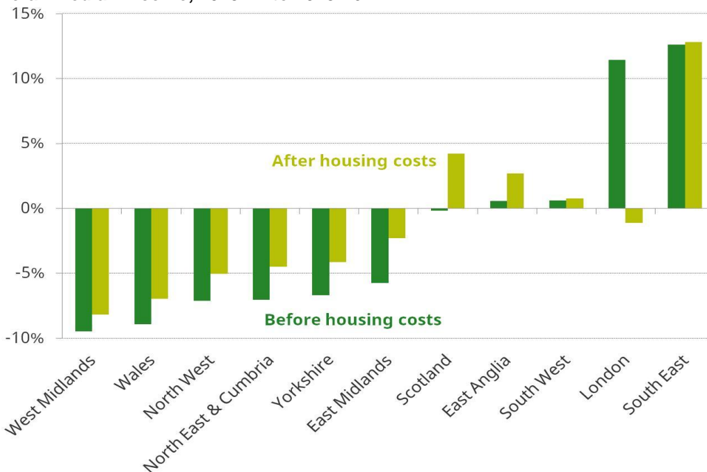
Chart 2 - Percentage difference between median income in each region and nation of Great Britain and overall median income, 2013-14 to 2015-16