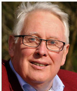
Bob Neill MP

We look forward to seeing you at one of the group’s events soon.