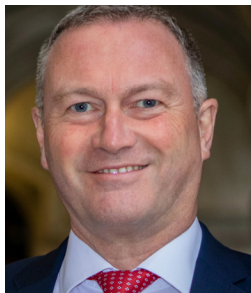
Steve Reed MP