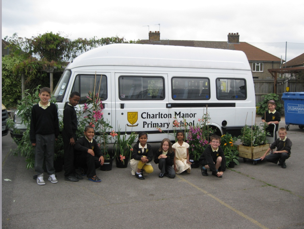
Loading the van