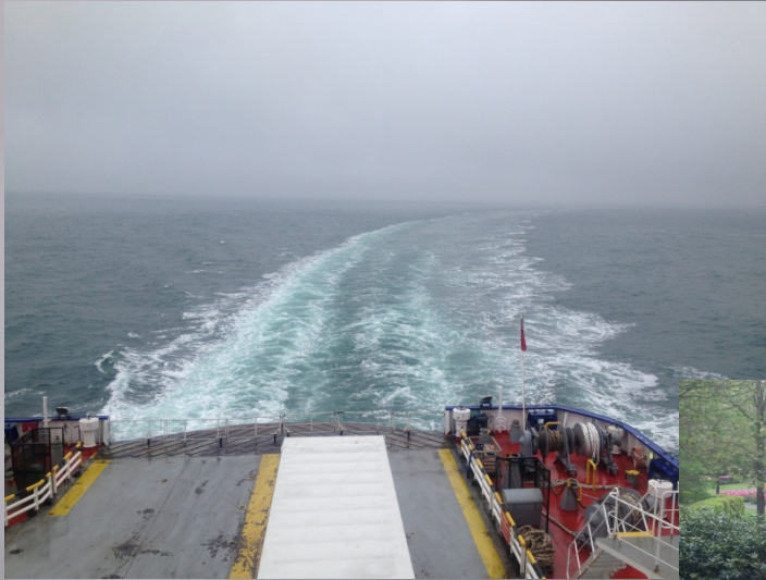
The Journey to Holland