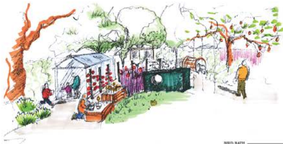
VIEW OF GREEN HOUSE FROM LAWN