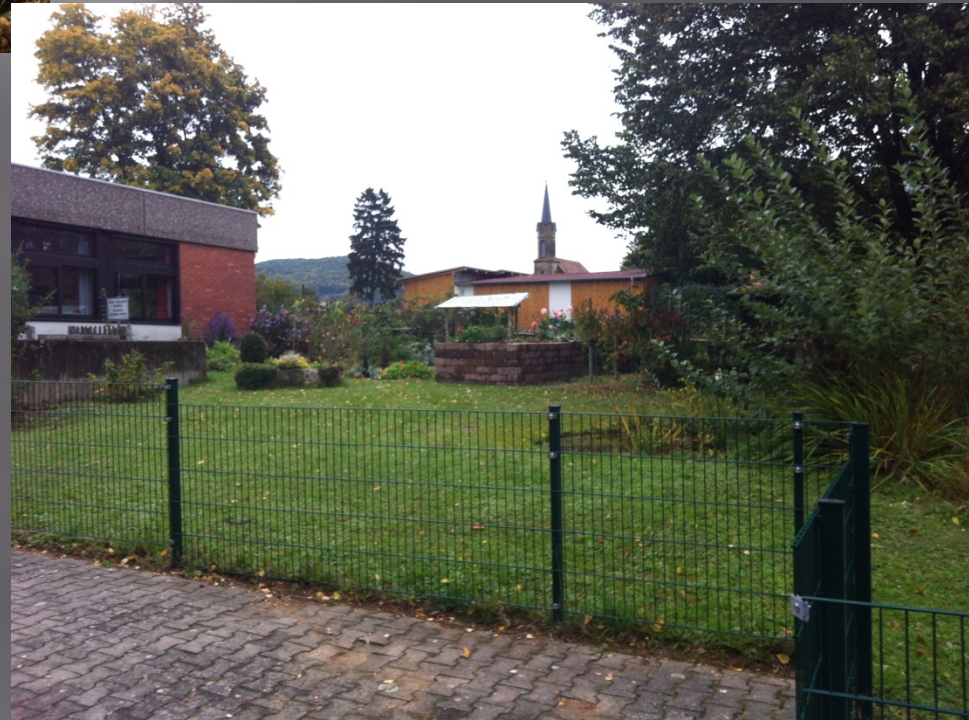
The near by Primary school