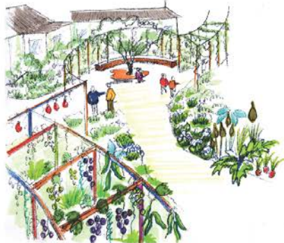
VIEW OF SEATING/EVENT AREA