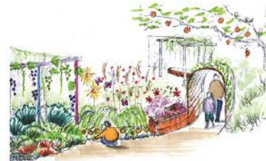
VIEW OF VEGETABLES AND FRUIT FROM KITCHEN