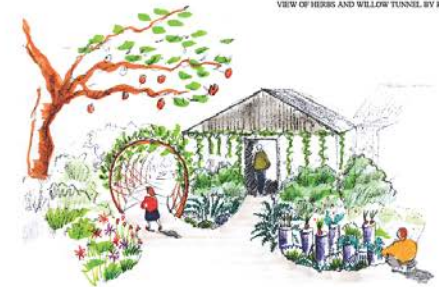
VIEW OF HERBS AND WILLOW TUNNEL BY KITCHEN