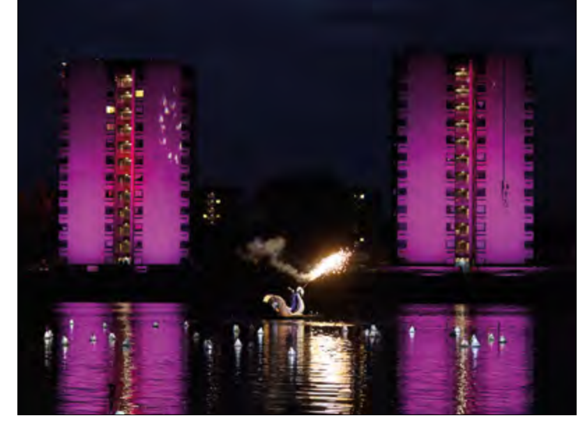
© Peabody, Thamesmead Community Archive (Ref: TMCA_PB_007_2)